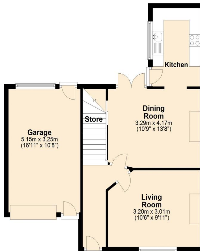
Ground Floor Approx. 59.4 sq. metres (639.5 sq. feet)